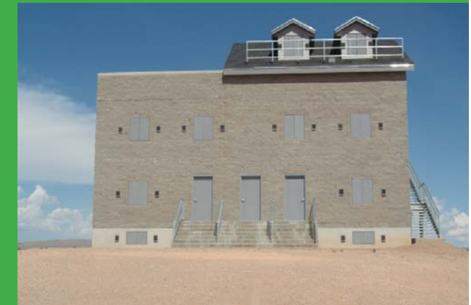
Urban Assault Course (UAC) Ft. Bliss, Texas