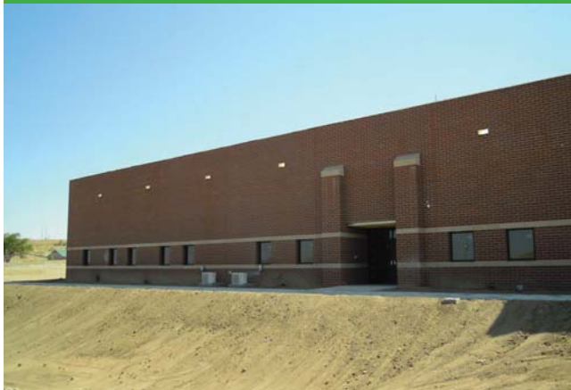
Training Support Center (TSC) Ft. Carson, Colorado