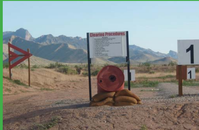
Combat Pistol Qualification Course (CPQC) Ft. Bliss, Texas