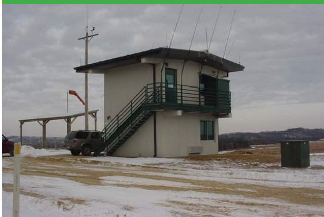
Infantry Platoon Battle Course (IPBC) Ft. McCoy, Wisconsin

HSW, a 20-year old engineering and science firm with an extensive history of federal facility work, is one of the prime contractors under the Range and Training Land Program (RTLTP) for the US Army Corps of Engineers to provide full-discipline A/E support services CONUS and OCONUS. HSW range design projects include: