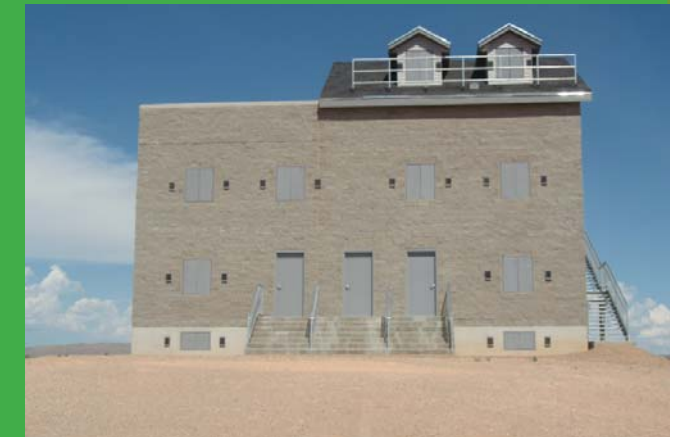
Urban Assault Course (UAC) Ft. Bliss, Texas