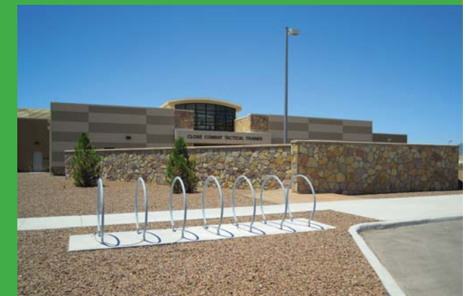
Close Combat Tactical Trainer (CCTT) Ft. Bliss, Texas