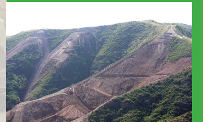
Special Missions Training Branch (SMTB) Battle Course Camp Pendleton Marine Corps Base (MCB)